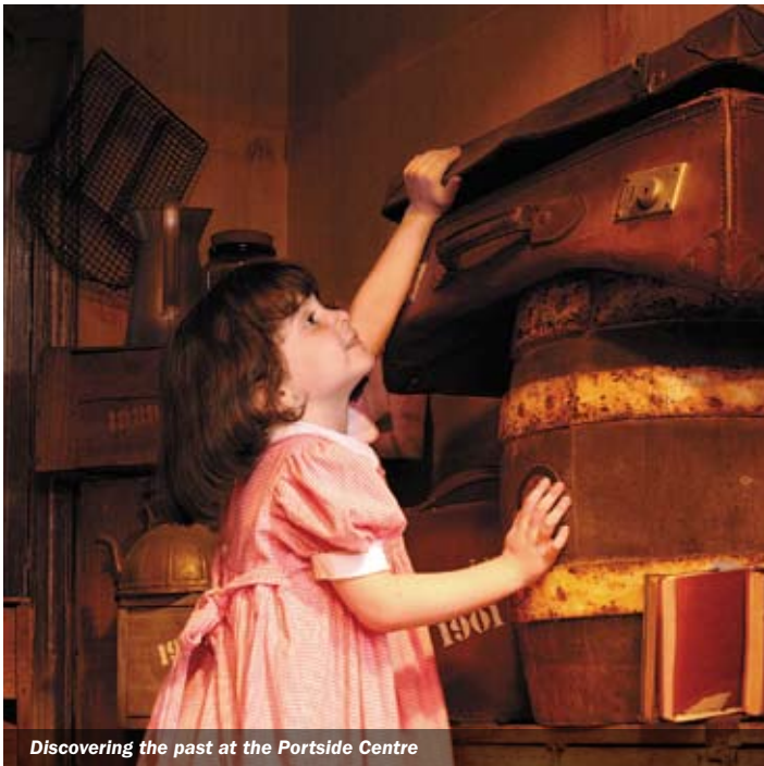
Discovering the past at the Portside Centre