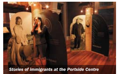
Stories of Immigrants at the Portside Centre

Ph: (07) 41 905 730. Open 10am – 4pm daily. Public holidays 10am – 1pm.